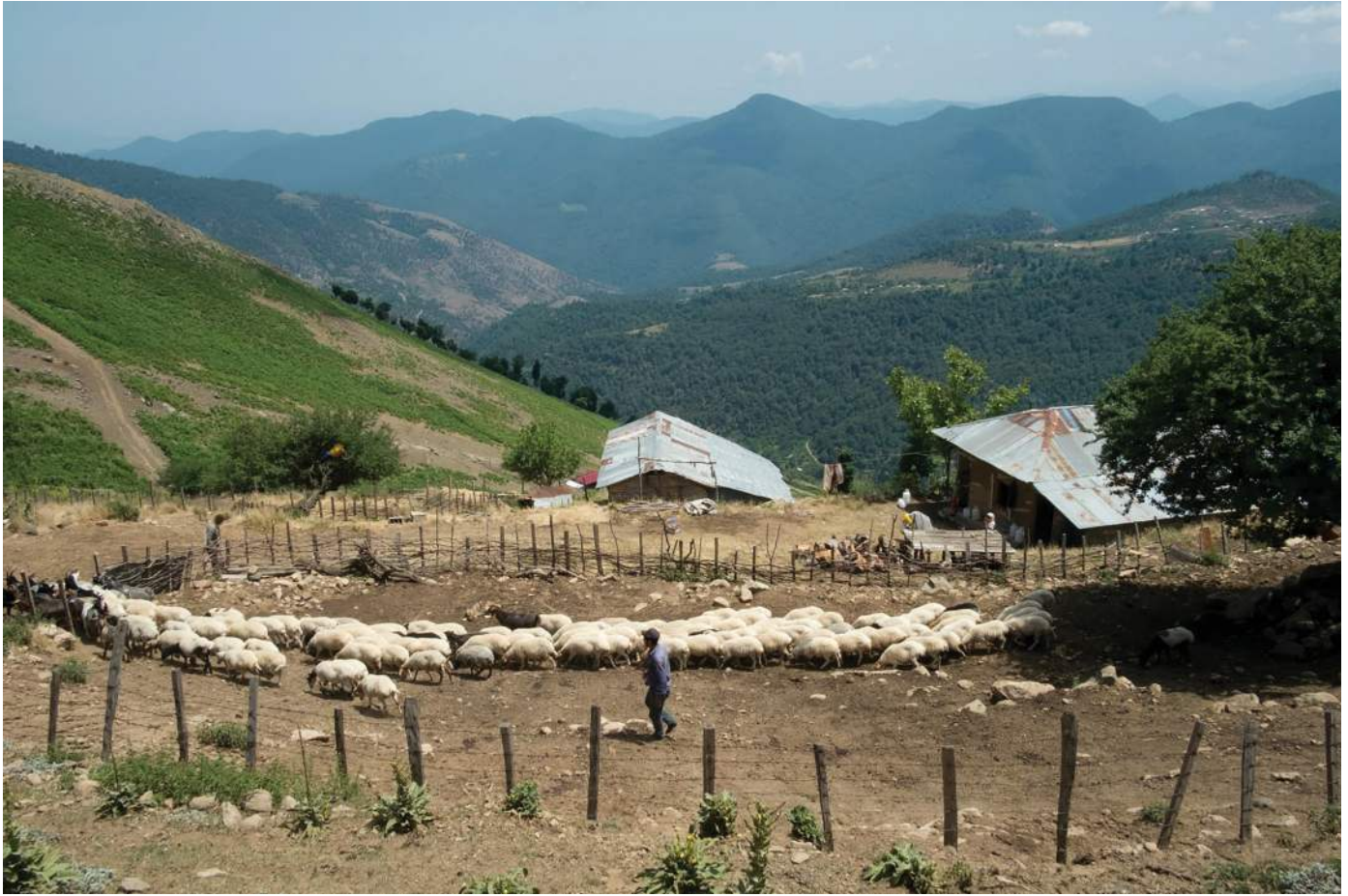
A pastoral farm in Iran, an MIC in the Middle East